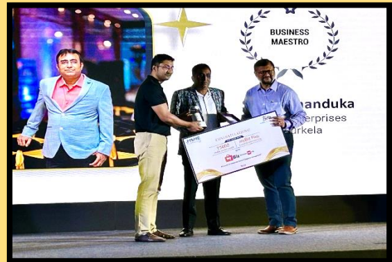
Business Maestro Award at Tally MSME Awards 2024