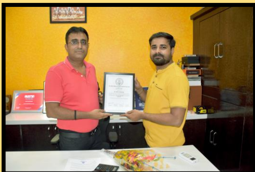
IIA Odisha Chapter Felicitation