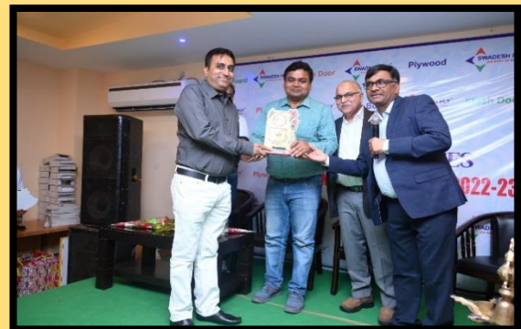
Swadesh's 1 st Dealer in Odisha