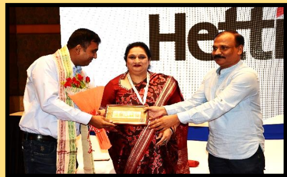
IIA Odisha - Rourkela Centre Appreciation