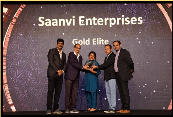
Pidilite Gold Elite Chairman Club at Abu Dhabi, UAE