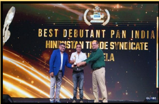
Century Udaan Club at Bali, Indonesia