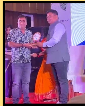
Swadesh Award for 3 rd Highest Sale in Odisha, 2023-24