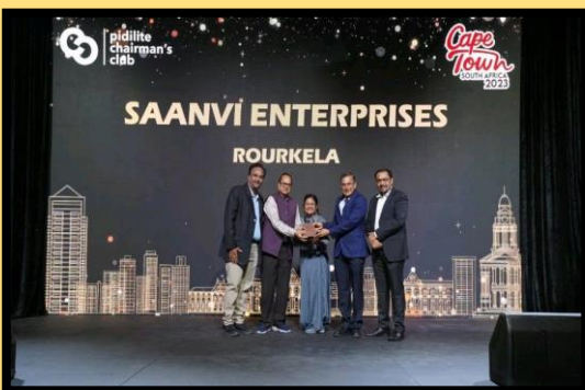
Pidilite Chairman's Club at South Africa